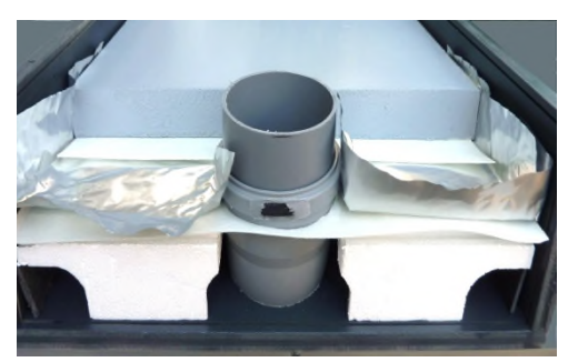
RadonProtect Foil with ventilation floor WIKA HOBO

Note: All actions must be cleared with the responsible architects and planners. The operating specialist company is exclusively responsible for the professional installation of Radon Protect Foil System. Our information sheet is to advise you to the best of our knowledge. All included information is based on empirical values under normal conditions. This is not a legally binding warranty. Our application and processing guidelines are meant only to assist our customers when using our products.